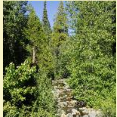
EBBETT'S PASS FOREST WATCH

The pencils you buy can determine the fate of the Sierra forests and help to ensure they are not only a lesson in history, but a treasured resource for generations to come.